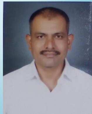
PEON Kogad R.M. R. Δ