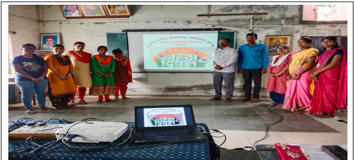
EVENT WITH LCD PROJECTER